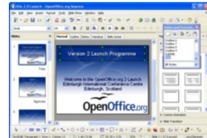
Screenshot of OpenOffice.org Presentation module